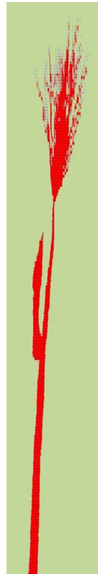
Analog Data, 2-colours